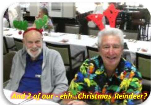
And 2 of our - ehh...Christmas Reindeer?