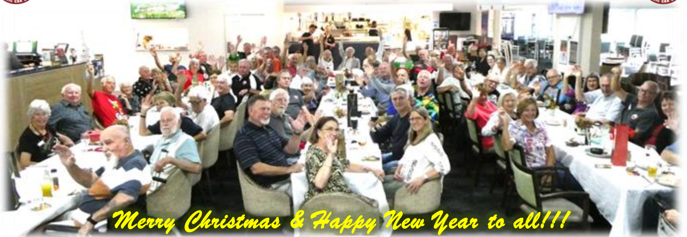
Merry Christmas & Happy New Year to all!!!