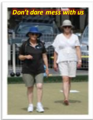
Don't dare mess with us