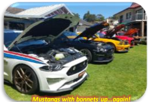
Mustangs with bonnets up...again!