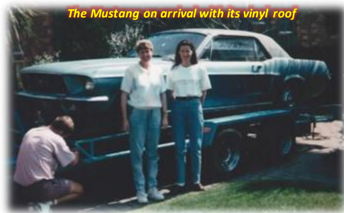
The Mustang on arrival with its vinyl roof