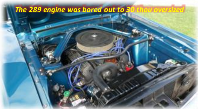
The 289 engine was bored out to 30 thou oversized