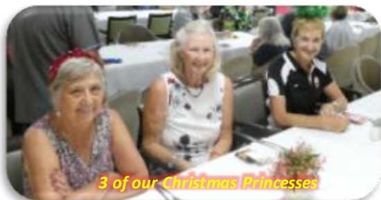
3 of our Christmas Princesses