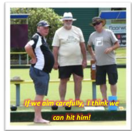
If we aim carefully, I think we can hit him!