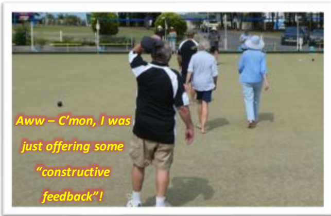
Aww – C'mon, I was just offering some “constructive feedback”!