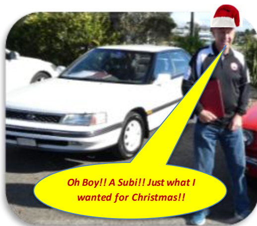
Oh Boy!! A Subi!! Just what I wanted for Christmas!!

I hope everyone has had a safe & happy Christmas. All the best in 2025 and I look forward to seeing you at events.