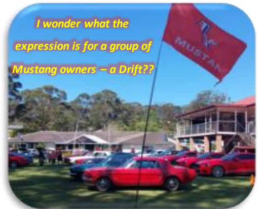
I wonder what the expression is for a group of Mustang owners – a Drift??

On Sunday, 13 October the locals of Kings Point had a mini car show dedicated to Ford Mustangs. The hosts opened their homes to visitors and had the Big Screen TV for the annual Bathurst 1000!! What Wonderful hosts indeed!!