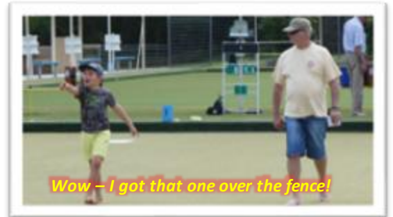
Wow – I got that one over the fence!