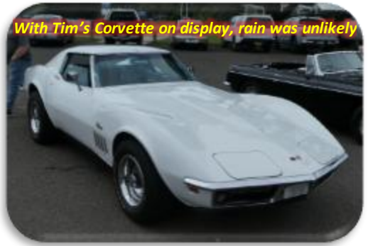
With Tim's Corvette on display, rain was unlikely

Initially, the clouds kept attendees comfortable, but as the humidity rose and the clouds disappeared, so did members as the car park become an oven!