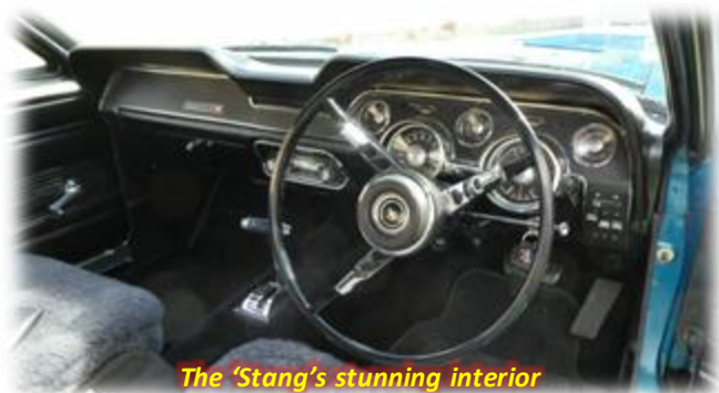
The 'Stang's stunning interior