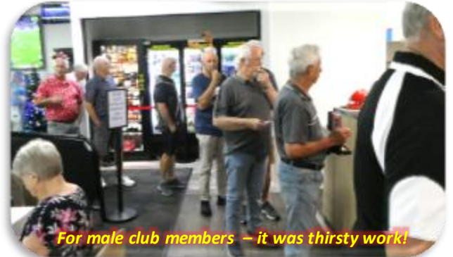
For male club members – it was thirsty work!