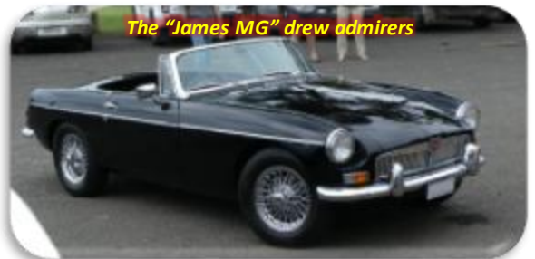
The "James MG" drew admirers