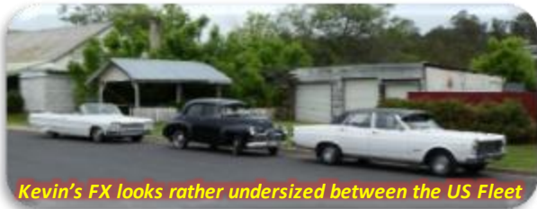
Kevin's FX looks rather undersized between the US Fleet