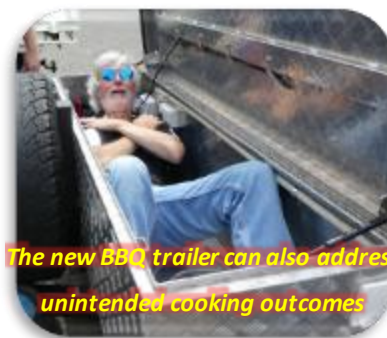
The new BBQ trailer can also address unintended cooking outcomes