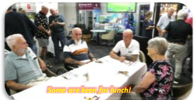
Some are keen for lunch!

Please support all our advertisers where and whenever you can