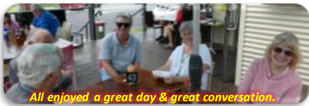
All enjoyed a great day & great conversation.