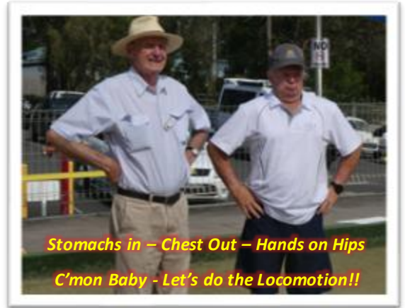
Stomachs in – Chest Out – Hands on Hips C'mon Baby - Let's do the Locomotion!!